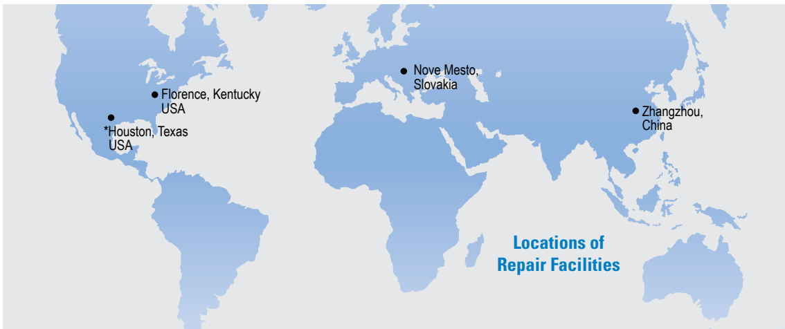
Locations of Repair Facilities