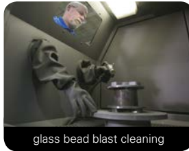
glass bead blast cleaning