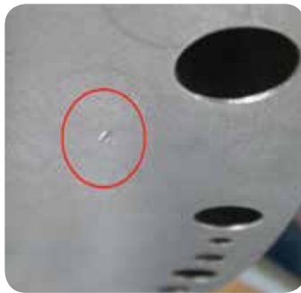
Damage from handling