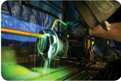
Image 4 – Spool piece undergoing MPI

After a visual inspection and confirmation of the returned parts, a mechanical evaluation is performed on all critical dimensions such as the mating male and female pilots. The pilots are designed with a slight interference fit in order to maintain concentricity between parts. Wear on the pilots will increase with each installation, which may lead to balance issues. Additionally, Magnetic Particle Inspection (MPI) is performed on all major components, as seen in Image 4.